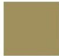
Sonoma Gold 3 LBS CC54