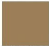
Golden Beige 2 LBS CC50