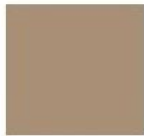
Oatmeal Buff 1.5 LBS CC52