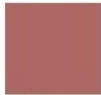
Georgia Brick 3 LBS CC11