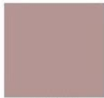
Berry Hill 1.5 LBS CC11