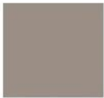
River Sand 0.75 LB CC52