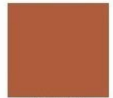
Firebrick 4 LBS CC34