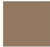
Rich Earth 3 LBS CC64