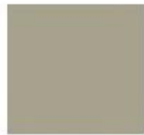
Buckskin 1 LB CC54